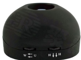
10x Portable Illuminated Magnifier (10xPIM)